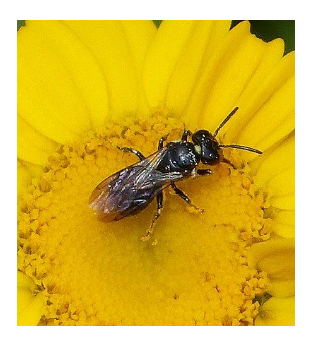
Small carpenter bee, Ceratina cucurbitina .

Master Gardener volunteers work with Extension specialists and educators to grow our knowledge of sustainable gardening practices by taking part in citizen science and research projects. An ongoing research project is investigating how to improve pollinator overwintering habitat in residential landscapes.